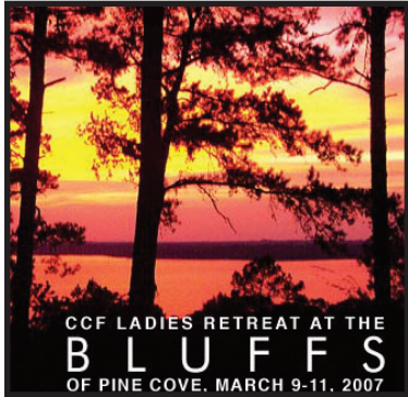
CCF LADIES RETREAT AT THE BLUFFS OF PINE COVE, MARCH 9-11, 2007