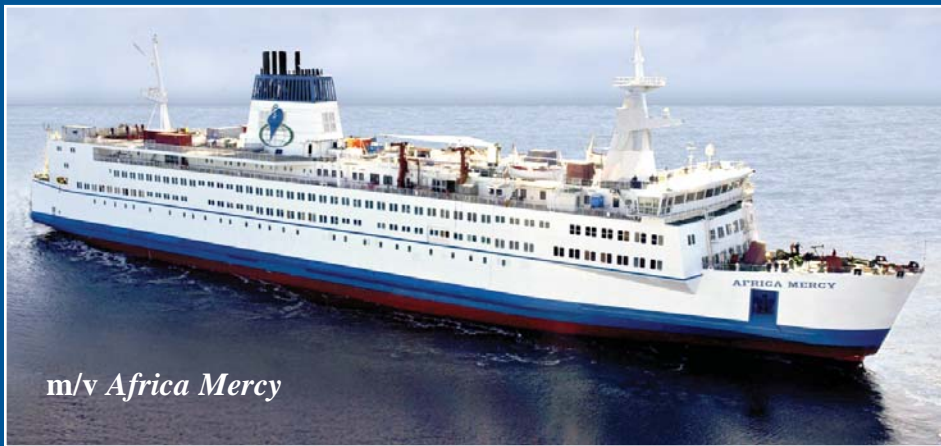
m/v Africa Mercy

“Mercy Ships excels in demonstrating the heartfelt compassion of Christ in hands-on, practical ways. I have seen the Mercy Ships team in action and have been moved to tears, knowing that thousands are being reached with the hope and help of Jesus!”